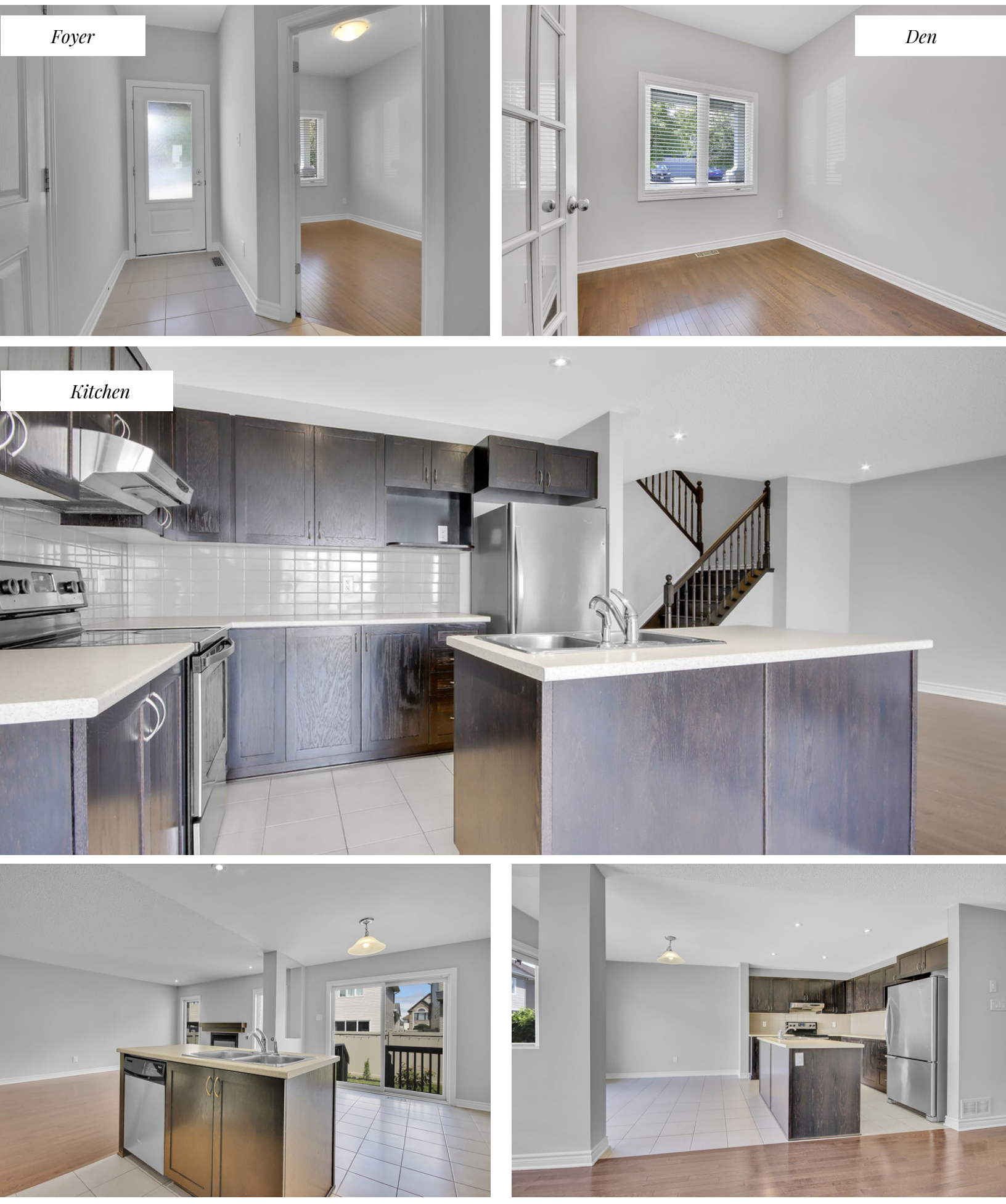
Information herein deemed reliable but not guaranteed.