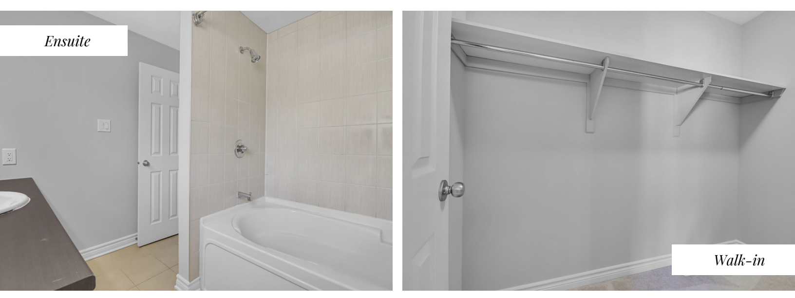
Information herein deemed reliable but not guaranteed.