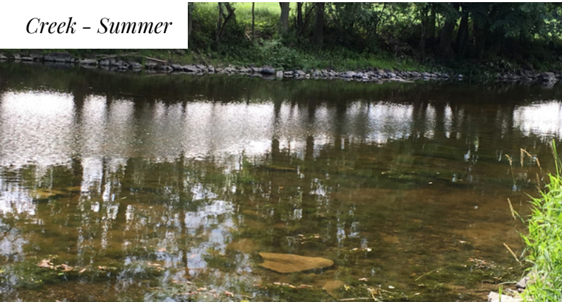
Creek - Summer